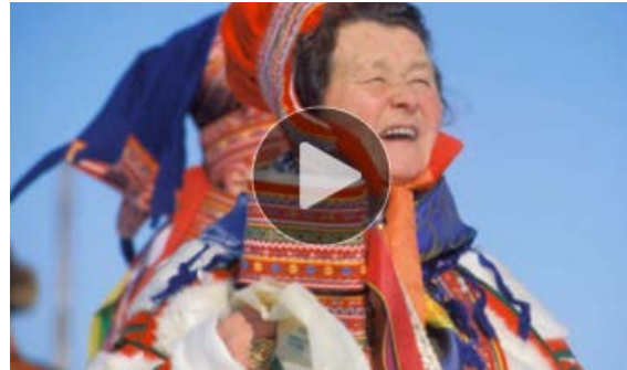
Watch a short video with images of Sami life here .